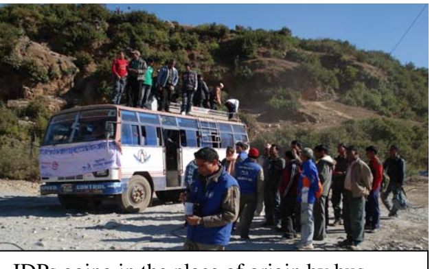
IDPs going in the place of origin by bus

hundred thousand. All the IDPs are living in a miserable condition across the country. A short assessment of INSEC in 24 districts of Mid and Far western in August 2007, reveals that a total 5,839 people of 1034 household have been found in the place of displacement at the district headquarter and adjoining places. To resolve the problem of rehabilitating IDPs and to extend them support the Nepal government have been formulated 'A policy on IDPs 2063 BS' and is also mulling to announce an integrated rehabilitation package. In the same manner, human rights organization INSEC and Nepal Red Cross Society have been running assistance to IDP returnees project in 24 districts of Mid and Far western